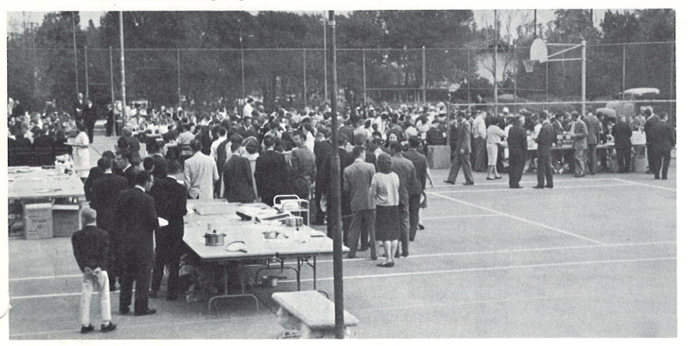
Southland brethren assemble for feasting and fellowship.

Tournaments are arranged on rapidfire schedules to eliminate anything that (Continued on Page 2)