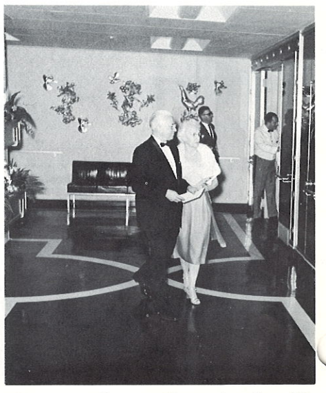
The beauty of a very fine and modern ship.